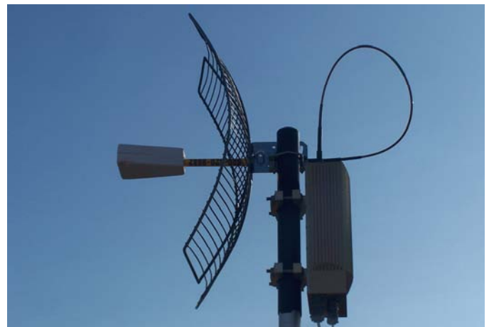
This DataPath WPPL configuration includes an integrated multi-band antenna and transceiver modem system mounted on a mast.